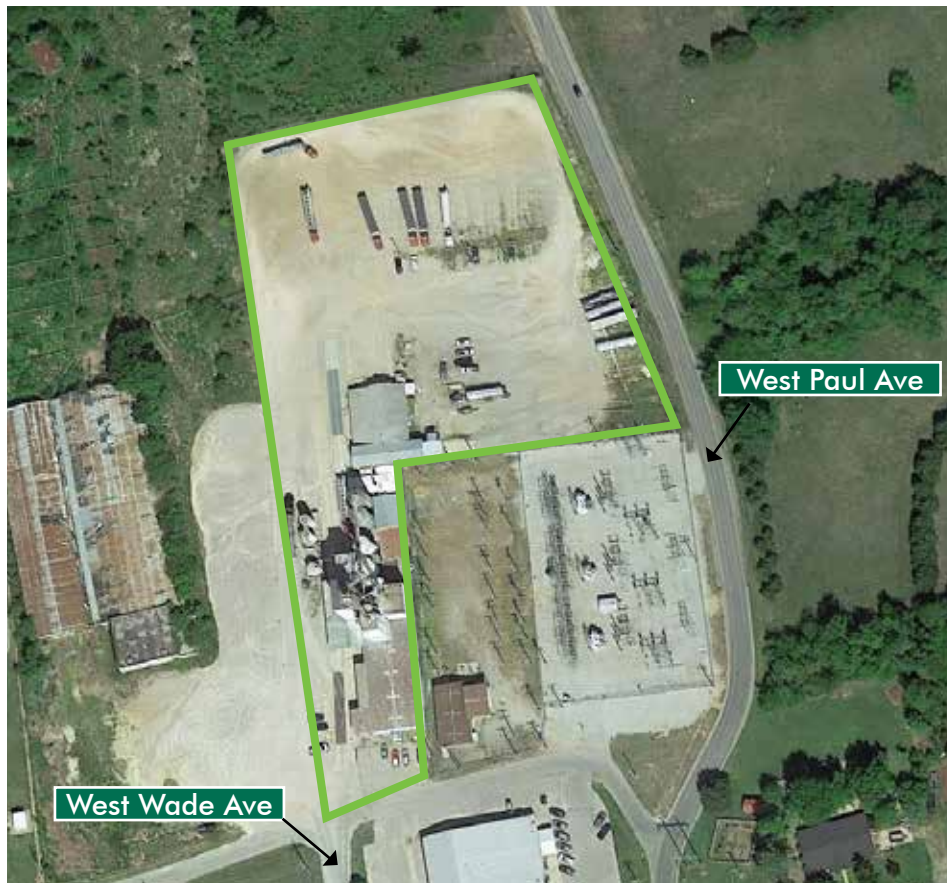
Parcel boundaries are an estimate