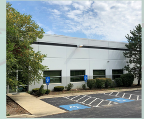
528 CONGRESS CIRCLE S. ROSELLE

Lease Renewal | 33,510 SF Landlord Representation