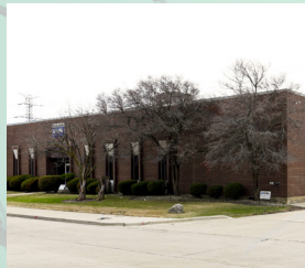
450 WRIGHTWOOD AVE. ELMHURST

New Lease | 42,924 SF Landlord Representation