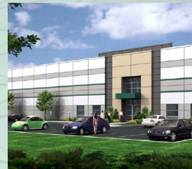
1160 PIERSON DR. BATAVIA

New Lease | 92,915 SF Tenant Representation