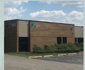
877 SUPREME DR. BENSENVILLE

Lease Renewal | 58,000 SF Tenant Representation