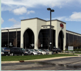
880 S. ROHLWING RD. ADDISON

Lease Renewal/Expansion | 357,465 SF Tenant Representation