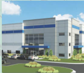
10701 FRANKLIN AVE. FRANKLIN PARK

Lease Renewal/Expansion | 357,465 SF Tenant Representation