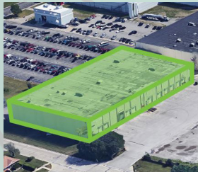
7401 S. 78 TH AVE. BRIDGEVIEW

New Lease | 51,842 SF Landlord Representation